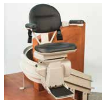
Mid-park and charge station for staircases with middle landings.