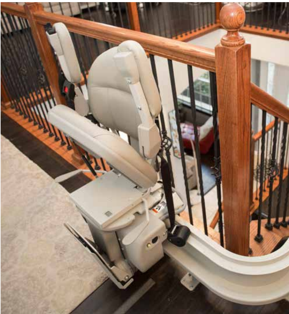
Custom made specifically for your home.