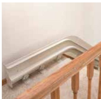
Top or bottom park position extends rail away from the staircase.