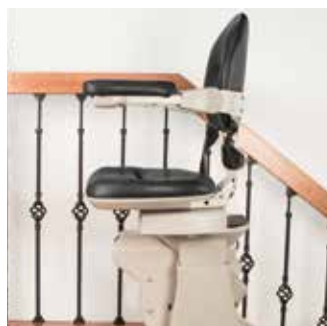
Power swivel sea. Control on chair armrest or wireless call/send.