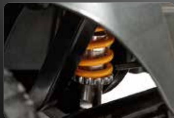
Pride's CTS Suspension

Exclusive stylish, lightweight, non-scutting, black, low-profile tires (Optional pneumatic tire on the 4W: S67)