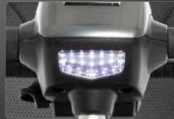
LED headlight in tiller

Experience the Revo® 2.0 , the most impressive mid-size scooter that combines an array of features into one great package. Tough and built to last, the Revo 2.0 offers rugged dependability you expect from luxury mid-size scooters. Comfort-Trac Suspension (CTS) ensures a smooth and comfortable ride over varied terrain. Experience convenient, feather-touch disassembly for portability that is comparable to our Travel Mobility line. Enjoy standard under seat storage and speeds up to 5 mph.