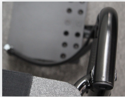
Center Pivot Swing In And Swing Out Front Rigging